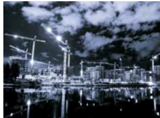
Athletes Village construction in Vancouver, BC