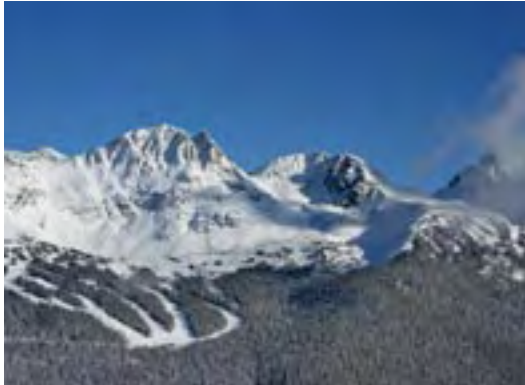
Olympic venue in Whistler, BC

As the 2010 Olympics near, Vancouver is being transformed into a city with a new look and a new spirit. The spirit of the games is surrounding us—at the workplace, at schools and in our communities. So how exactly has Vancouver transformed itself? Let us look at some of the developments in the city to welcome the Olympic Games.