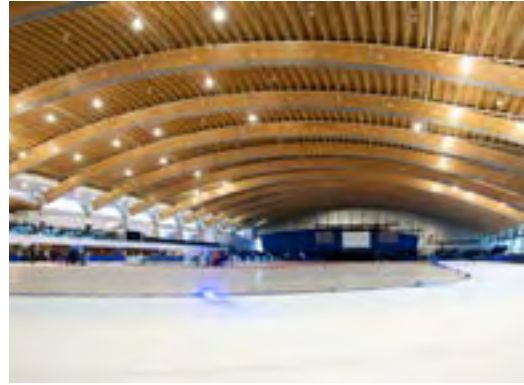
Richmond Olympic Oval speed skating venue in Richmond, BC

The Olympic Torch Relay will be the largest one in Olympic history, reaching ninety percent of Canadians in 106 days. It will be a great opportunity for Canada to showcase the spirit of its people and heritage, and to unite Canadians in celebrating the Games as a nation-wide event. Online applications to become a torchbearer are